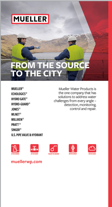
Trade show graphic