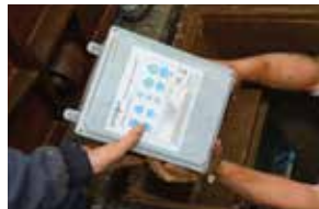
Step 3: Mount the node and power source enclosures in the manhole or in an above ground panel.