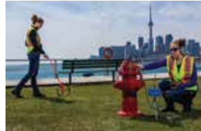
Step 2: Complete acoustic measurement to determine baseline normal operation.