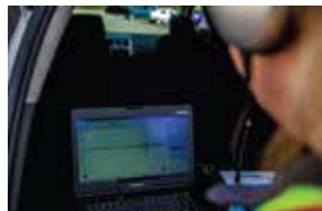
Step 5: Test and verify the operation of all installed equipment.