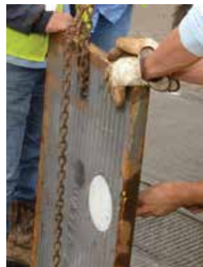
Step 4: Install Rugged Antenna.