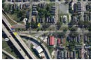
Step 1: Select suitable location for the node components.