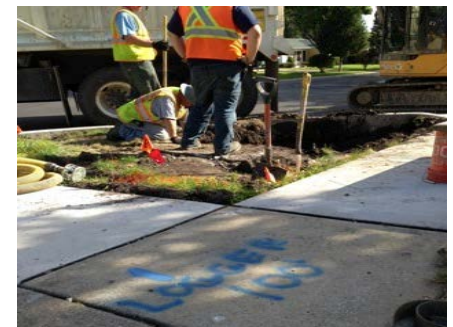
Figure 3 Digging trench for Kincaid Ct leak.

In September, the acoustic monitoring successfully identified a leak that was draining into a storm sewer. Water from this leak was unlikely to surface. It could have taken more than six months for the break to grow large enough to be detected. With monitoring, the leak was identified and repaired within 12 days with minimal damage to surface features.