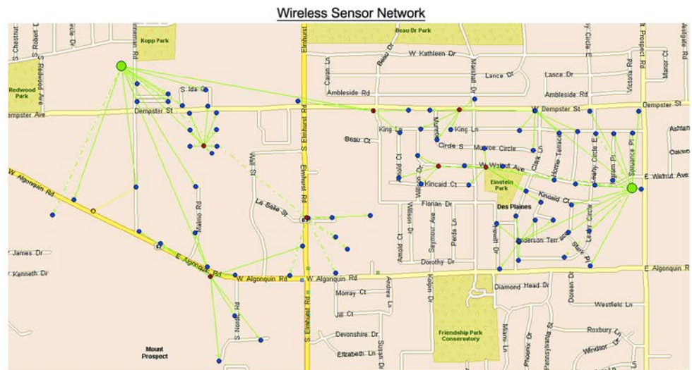
Figure 2 Green dots are hubs located on tanks, red dots are relays, blue dots are sensors, and the yellow dot indicates a logger that didn't work and is being replaced.